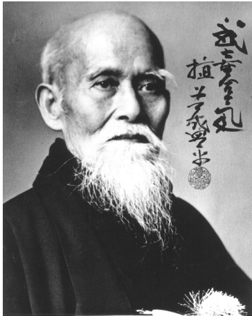
O-Sensei | Morihei Ueshiba | 1883-1969